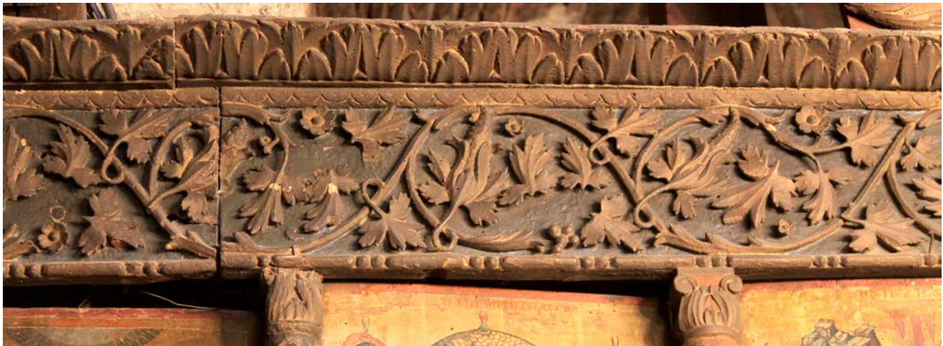
Fig. 6 Details of wooden iconostasis of "Vlatadon" Monastery.

might have also been done some maintenance of the iconostasis, during the renovation work of the church in 1907. The appearance of the specific iconostasis may not be as impressive as the previously mentioned, but it is indeed of great importance, because several parts of the iconostasis are much older, such as the Cross (late 16th century - 18th century), possibly obtained from a previous wooden iconostasis and handcrafted with excellent technique (Hatzitryfonos 1985, Mantopoulou-Panagiotopoulou 1989). The carved sections of the iconostasis are made of walnut, shaped in a low relief that gives the sensation of a flat surface, but its embellishments, crafted with excellent art, almost totally carved, they look like as if they are glued to the surface and provide a natural appearance (Fig. 6). In one stage of the renovation process of the iconostasis, some parts were replaced, due to their wear, with new ones, like the eight colonnettes and small chapters of some other colonnettes, a fact that is apparent, mainly due to the existence of different quality of work. Unlike the upper part of iconostasis, the lower part is later and very simply constructed, with painted horizontal wooden boards placed in frames. In previous studies on the monastery, the bema door is referred, which now does not exist anymore. In the north chapel of the church there is also a wooden carved iconostasis that may have been built in one of the recent renovations (Stojoglou 1971).