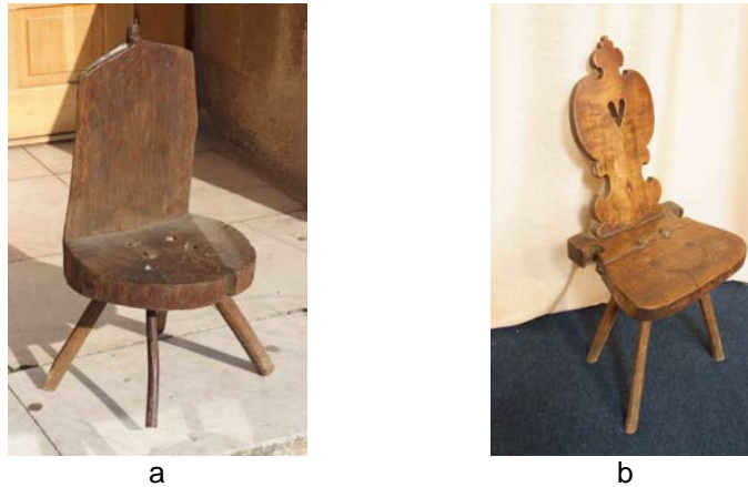
Fig. 1 a - Chair made from a single stump (Chior, middle of the XIX century) b - Chair made with the hatchet (second half of the XIX century).

Regarding the decor of the Maramures rural chairs, we encountered the point of view that this area falls under the artistic conception of the manufacturers of wooden churches, which requires first a monuments silhouette. (Capesius 1974) From the construction point of view, certainly the oldest seats with backs have been created after the wood stumps from which they were created, as shows a piece from the collection of the Ethnographic Museum in Baia Mare collected from the Chioar zone (Fig. 1a).